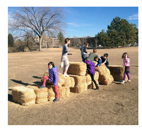
Figure 2: Hay bale constructions.

The responses documented differences in point of view, both physically and audibly. The nephew of Admiral Burke saw the pond as a place to skinny dip, ice skate and duck hunt. It was a farm, as he knew it, full of hay and dairy cows. He claims